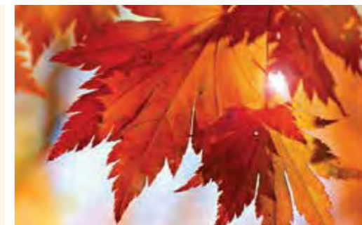
SE8 Autumn-Kit Art. 1678 No. 100, SERALON® 200m . 100% Polyester