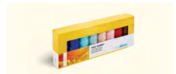
PS87 Kids-Kit Art. 4820 No. 40, POLY SHEEN MULTI® 200 m . 100% Polyester Art. 3406 No. 40, POLY SHEEN® 200 m . 100% Polyester