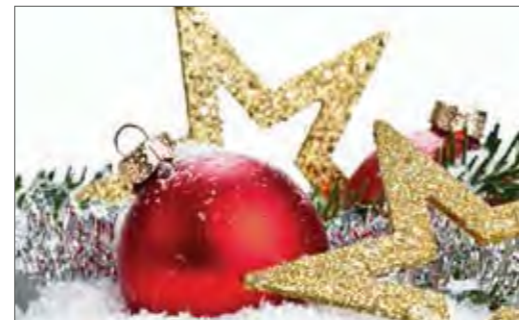
Christmas 8-Kit Art. 3406 No. 40, POLY SHEEN® 200 m . 100% Polyester / Art. 7633 . METALLIC 200 m . 55% Polyester . 45% Polyamid