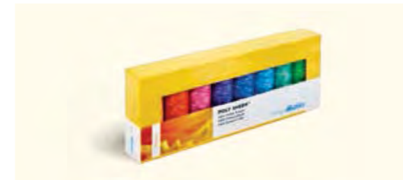
PS81 Pastels-Kit Art. 4820 No. 40, POLY SHEEN MULTI® 200 m . 100% Polyester