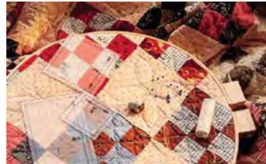
SFQ80136-Kit Art. 136 No. 40, QUILTING 100 m . 100% Mercerized Cotton