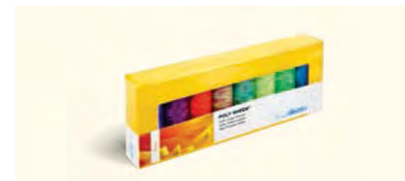
PS89 Neon-Kit Art. 4820 No. 40, POLY SHEEN MULTI® 200 m . 100% Polyester Art. 3406 No. 40, POLY SHEEN® 200 m . 100% Polyester