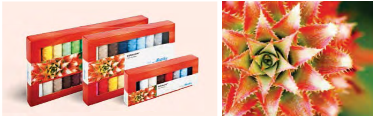
SE28-Kit Art. 1678 No. 100, SERALON® 200m . 100% Polyester