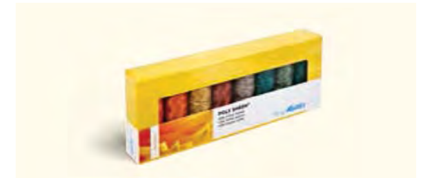
PS83 Autumn-Kit Art. 4820 No. 40, POLY SHEEN MULTI® 200 m . 100% Polyester Art. 3406 No. 40, POLY SHEEN® 200 m . 100% Polyester