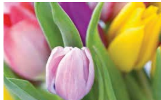
SE8 Spring-Kit Art. 1678 No. 100, SERALON® 200m . 100% Polyester