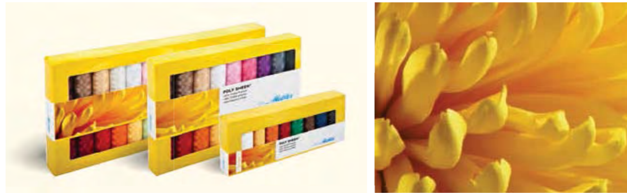
PS28-Kit Art. 3406 No. 40, POLY SHEEN® 200 m . 100% Polyester