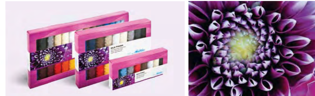
SF28-Kit Art. 105 No. 50, SILK-FINISH 150m . 100% Mercerized Cotton