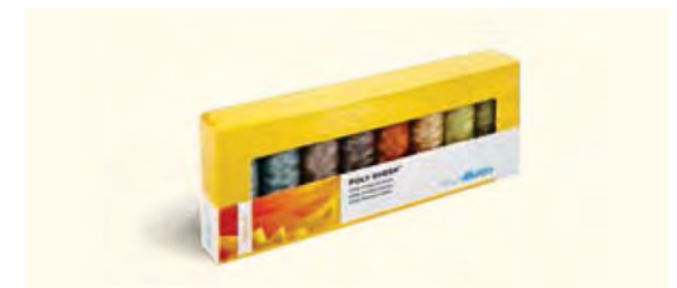
PS85 Neutrals-Kit Art. 4820 No. 40, POLY SHEEN MULTI® 200 m . 100% Polyester Art. 3406 No. 40, POLY SHEEN® 200 m . 100% Polyester