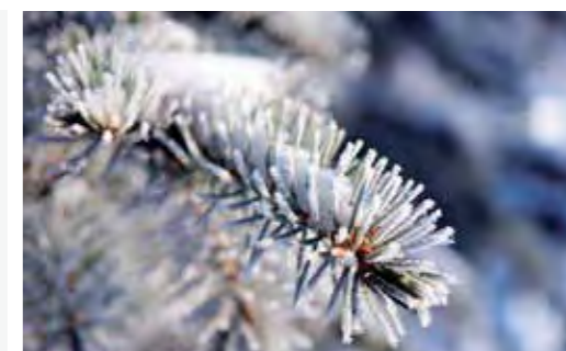
SE8 Winter-Kit Art. 1678 No. 100, SERALON® 200m . 100% Polyester