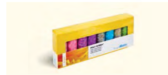
PS811 Brights-Kit Art. 4820 No. 40, POLY SHEEN MULTI® 200 m . 100% Polyester Art. 3406 No. 40, POLY SHEEN® 200 m . 100% Polyester